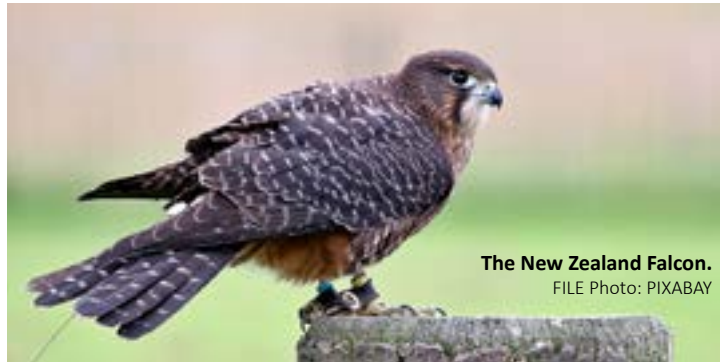
The New Zealand Falcon. FILE Photo: PIXABAY