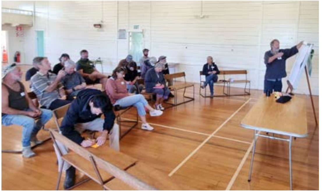
Farmers and landholders were among those who attended the inaugural meeting. BELOW: The Maratoto Valley.