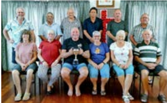
The winning Hauraki RSA team.