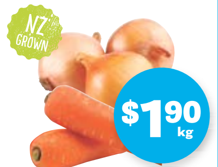
Loose Carrots or Brown Onions (Product of NZ)