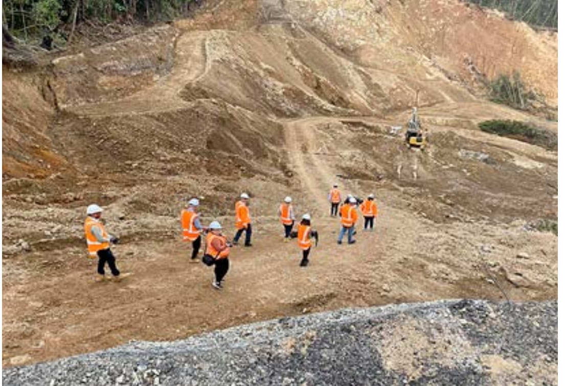
Media trek down the slope to see the State Highway 25A slip in person.

But gazing upon it in person, the 130 metres it encompasses feels so much more vast, im-