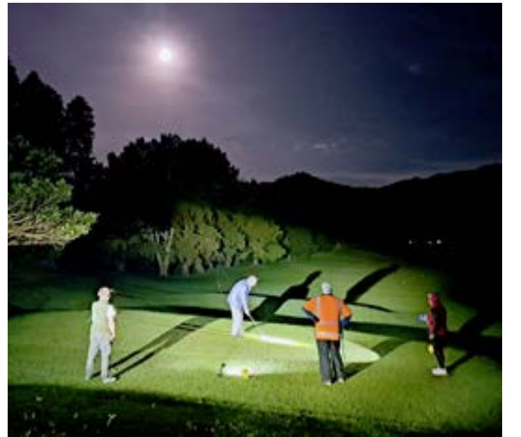
Golfers enjoy playing at night under a near-full moon.