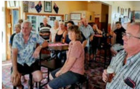
Teams observe a bowls match.