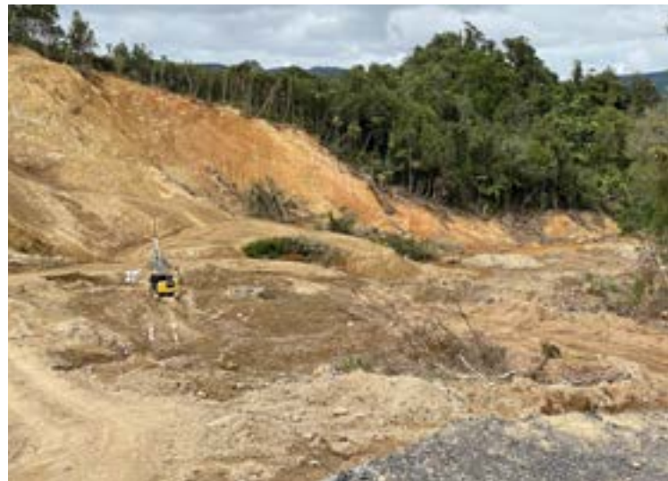
The drilling rig is almost four times as tall as a person. Within the slip site, it looks almost toy-like against the backdrop of orange soil.

LATEST UPDATE: Geotechnical investigations at the site of the slip on State Highway 25A were completed on April 4, Waka Kotahi confirmed. Fourteen boreholes were drilled and five test pits dug. Material found above and in the slip was variable, with rock discovered quickly in some areas, and other areas consisting of wet and soft soil. Waka Kotahi is planning to make a decision on a permanent fix in May. Work will continue at the site in the meantime, with drainage material being installed to protect the area.