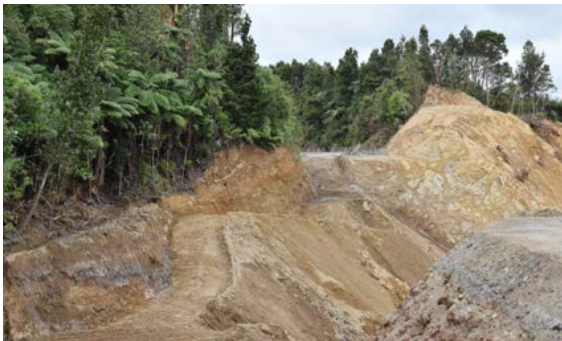
Looking from the Kōpū side of the road to the other edge, 130 metres away.