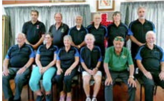
The Paeroa RSA team.