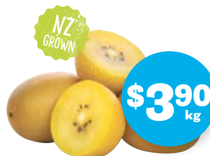
Loose Gold Kiwifruit (Product of NZ)

Prices apply from Monday 10 th to Sunday 16 th April 2023, or while stocks last at FreshChoice Waihi only. Limits may apply.