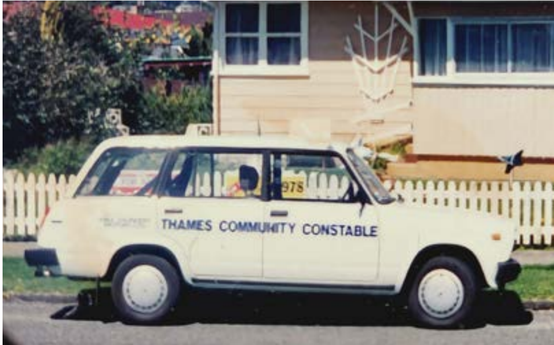
The second-hand Lada station wagon gifted to Thames Police in the 1970s.

The tired old grey 1972 Holden Belmont we had in Thames was worn out, but gradually the cars were replaced. The cities received the new cars, and we got the leftovers. I recall in the 1980s the Police were trying out Ford Falcons and had some converted to CNG fuel (Compressed Natural Gas), to save money. The Huntly car had blown its motor, shortly