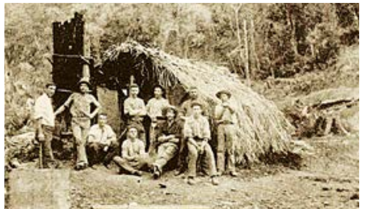
Men gather at midday meal time at a mining camp.