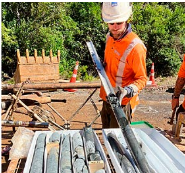
Geotechnical engineers have been taking borehole samples from the slip site.