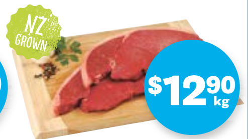
Fresh Beef Rump Steak or Roast (Product of NZ)