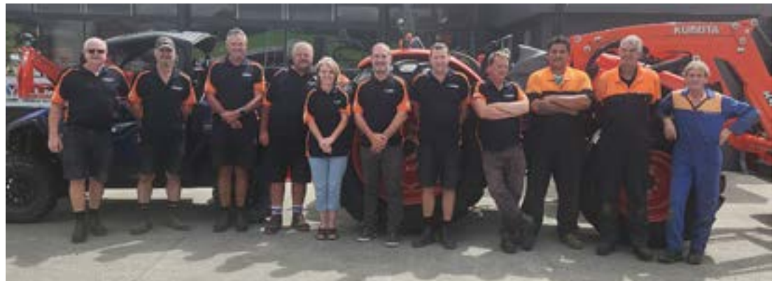
The Central Motors staff are staying on.