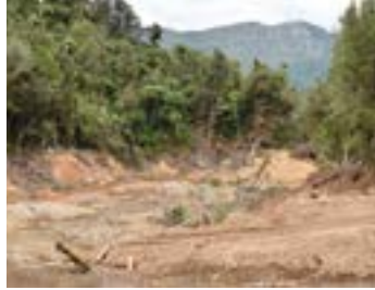
Debris has flown into the valley.

The road up to the site however, is still scarred from the wind and rain. Around every corner, sheer rock faces spill their guts towards the road, cleared now from the tarmac but still piled menacingly close to my tires as I drive cautiously towards the chasm.