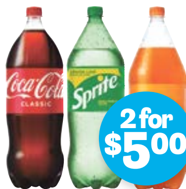
Coca-Cola, Sprite, Fanta, Lift or L&P Soft Drinks 2.25L Bottles