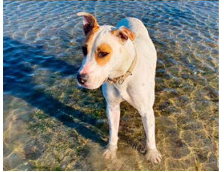
Buddy loves splashing around in water.

“He really enjoys playing with other dogs and people, and splashing around in the water, but also happy just to laze around and relax. He loves people and enjoys lots of cuddles.”