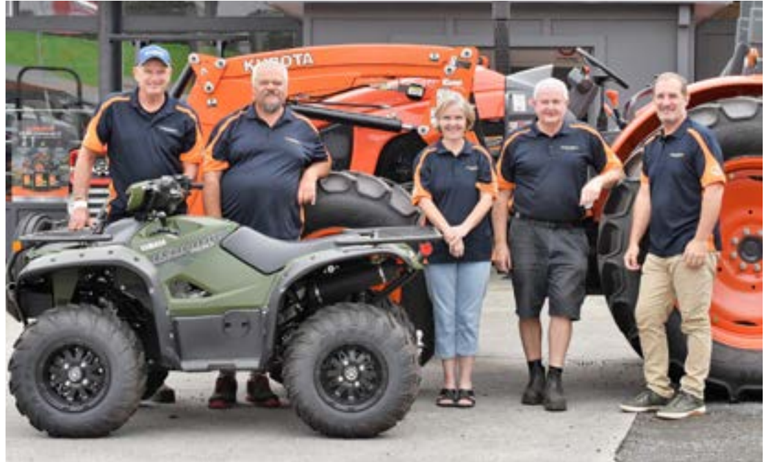
Head in to Central Motors to meet the team and find out how they can help you with your machinery and servicing needs.

"We just want the whole of the public to know that we've taken over and that the business is still here."