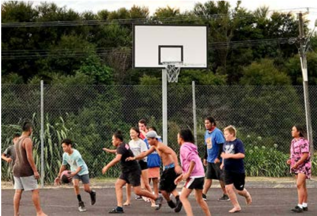
The Waihi Community Forum has been involved in several successful community projects, such as creating a 3x3 basketball area at Morgan Park.

The suggestions come as the forum conducts an online survey, asking residents what they think about the potential