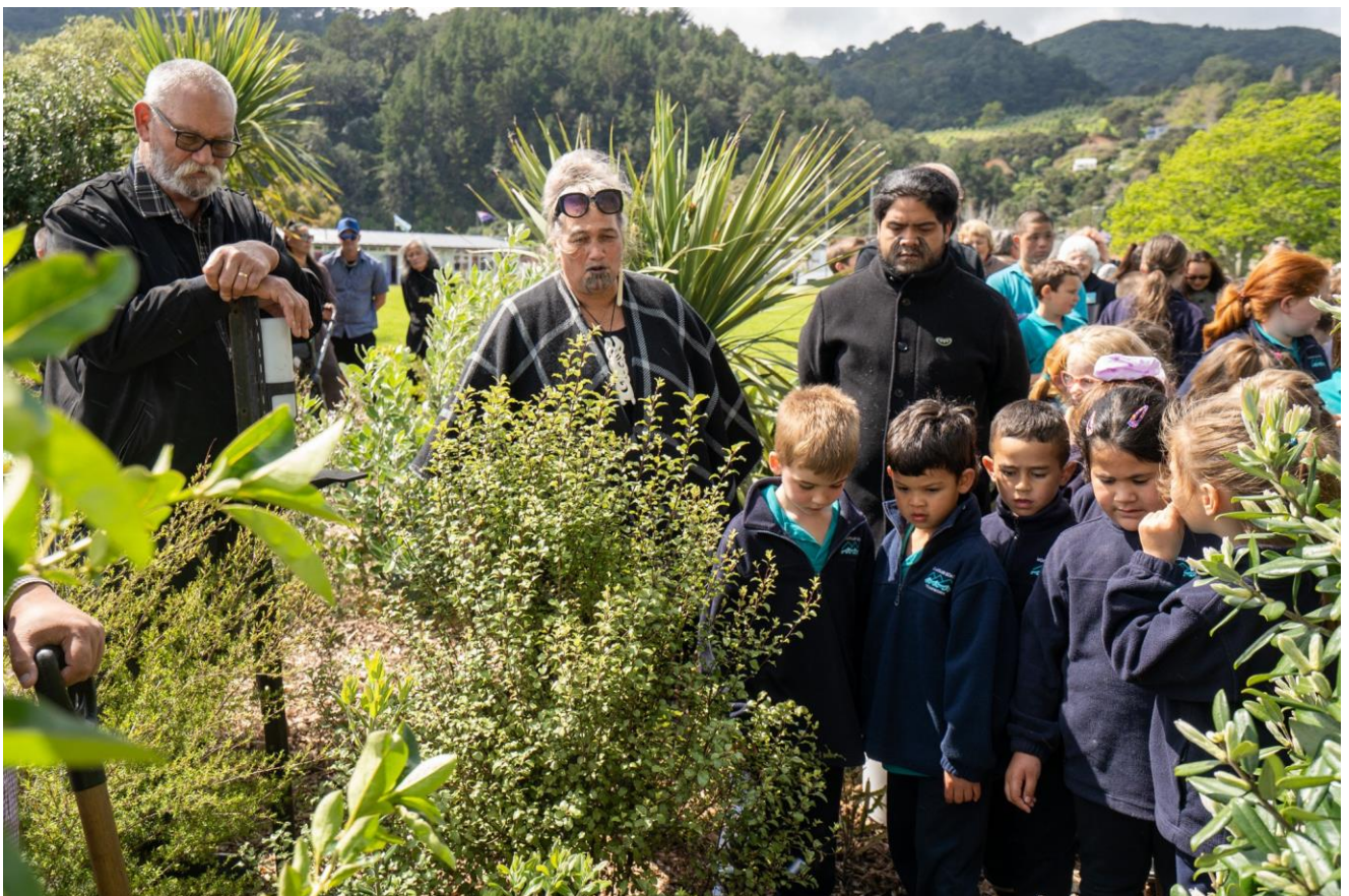
Planting of the 50 th reunion commemorative trees in our native garden after the pōwhiri last Friday.

Are you prepared at home for the possibility of an earthquake? You might like to do the practice at home or work at the same time as us.