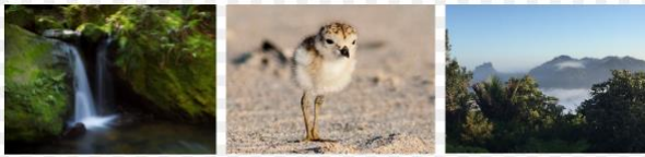
PREDATOR FREE HAURAKI COROMANDEL COMMUNITY TRUST

Please come & join us Wednesday 17th November 2021 5:30pm Meet at Thames Wharf Walk to- Kuranui Bay All donations & funds raised go to Wear PINK Donate to a good cause. Spot prizes and refreshments