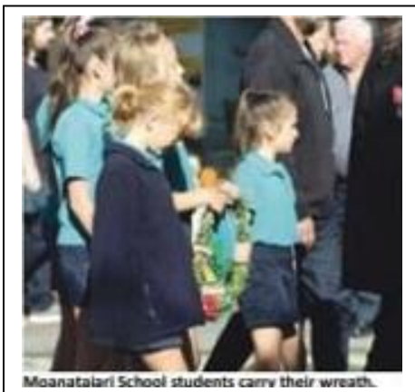
Moanataiari School students carry their wreath.