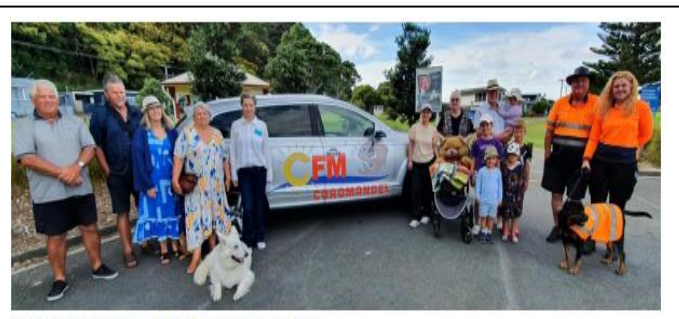
Children in Care - Te Manaaki Tamariki