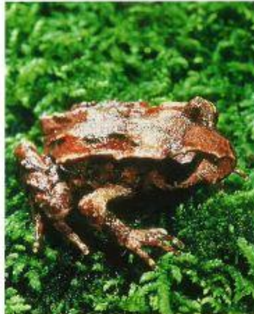
Rare Archey's frog are found in this area