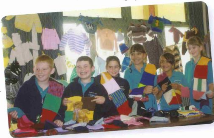
Children enjoying themselves.

Friday and Saturday 6 & 7 August 10am – 3pm Civic Centre, Thames